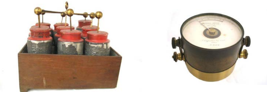
Fig. 3. Samples of ancient equipment, property of ISEP Museum: left) Battery with 9 Leyde bottles. Discovered in 1746 by Musschenbroek, Allaman and Cuneus; right) Deprez and Carpintier Ammeter.

ISEP is one of the top schools of technology in Portugal, and has been pioneering education and research in Engineering since 1852 and is also a trademark of Porto. Its long history is well documented in the local museum. Fig. 3 shows a sample of ancient lab equipment.