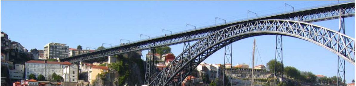
Fig. 2. Porto, UNESCO World Heritage.

and registered as a World Heritage Site by UNESCO in 1996. Its Latin name, Portus Cale , has been referred as the origin for the name “Portugal”, based on transliteration and oral evolution from Latin. In Portuguese the name of the city is spelled with a definite article as “o Porto” (English: the port). Consequently, its English name evolved from a misinterpretation of the oral pronunciation and referred to as “Oporto” in modern literature and by many speakers.