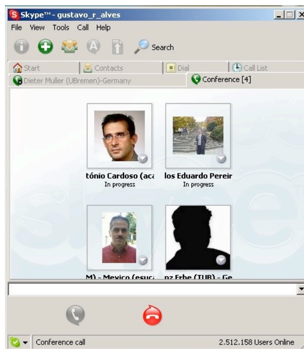
Figure 2. An EU-LA audio conference session with a moderator plus four participants.

The academic, non-commercial nature of RexNet also enables the association with similar networks, such as PROLEARN (a 'Network of Excellence' financed by the Information Society Technology programme of the European Commission), which deals with technology enhanced professional learning and (via workpackage 3 - in particular) online experimentation [33]. At this point in time, contacts have already been initiated and the process of establishing a partnership is underway.