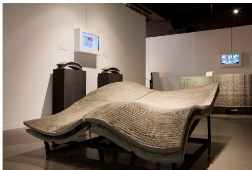
Figure 6 Free Form Construction panel prototype

Establishing some similarities to the ferroconcrete production system used extensively by Nervi, the problem of reinforcement and, simultaneously, of the formwork production is being addressed in the on-going research by Fabio Gramazio & Matthias Kohler "Mesh-mould" (Figure 4). This work investi-