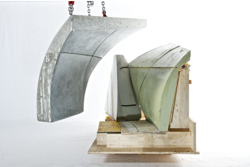
Figure 1 TailorCrete Project - Wax Formwork

Indirect intervention / Rigid Formwork / Subtraction. The fabrication of formwork noticeably continues to be a core issue in research, as it is reflected by most of the examples considered. However, there is an interest in exploring different strategies for its production with the aid of digital fabrication. To surpass the limitations of using standard EPS milled formwork, the TailorCrete project (Gramazio and Kohler 2011) [1] recently developed a wax-based formwork for complex geometries with the aid of robotic pin actuators (Figure 1). This strategy showed comparable efficiency to EPS systems but performed better in terms of the economy and ecology of the process, and of the surface finishing qualities of the fabricated pieces. At the same time, a greater level of geometrical freedom and texture expressions were made possible with EPS formwork by the adoption of 6 and 7-axis robotic arms instead of the standard 3-axis CNC routers commonly used for milling [4].