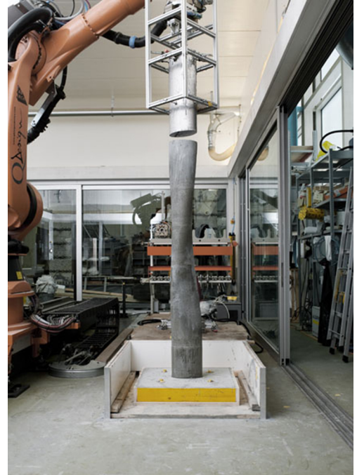
Figure 4 MeshMould research prototype

Indirect intervention / Dynamic Formwork / Additive. Dynamic formwork systems consist in those strategies that consider the displacement in space (e.g. translation) of rigid moulds to produce forms. Approaches that fall in this topic join some of the benefits of rigid formwork (e.g. the reduced difficulty of achieving smooth surfaces) with a higher degree of formal freedom through spatial movement. In the case of the Robotic SlipForm (Figure 3) process developed at the ETH in Zurich, the integration of a multi-axis robotic arm to control the vertical and rotational movement of the formwork in space, calibrating the deposition speed of the wet concrete, greatly increases the formal capabilities of an otherwise geometrically limited strategy. (Kristensen 2013)