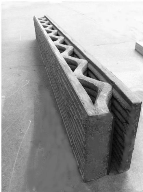
Figure 5 Contour Crafting wall prototype