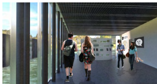
Figure 2: the future e-learning café at the botanical garden

The success achieved with this initiative lead the University to consider the launching of a second space of this kind. This second e-learning café has its preliminary project already approved by the rector team and is planned for the second biggest campus in connection with the University botanical garden. This second e-learning café is expected to be launched in 2013. The e-learning café is not just a space strongly equipped with technology for students and teachers to study and socialize; it is much more than that! A very rich program of workshops, concerts, exhibitions, and other activities is carefully planned to achieve the sharing of knowledge and the objectives foreseen.