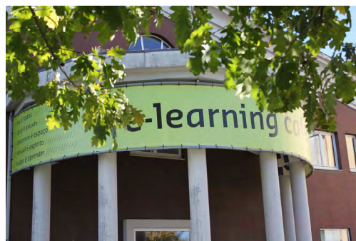
Figure 1: the e-learning café of UPorto

U.Porto is the largest Portuguese higher education institution, with a student community of more than thirty one thousand at its 14 autonomous faculties and business school [1]. The University recognizes the relevance of ICT for the overall performance of the institution and in creating unity in diversity. It is no surprise thus that U.Porto has encouraged the development of inclusive hybrid spaces for learning, socialization and leisure, integrating some important ICT functions. The first e-learning café in Portugal was opened by U.Porto in January 2008. It is located on the largest of the three campus of the University, available for all higher education students and alumni, even if they are not or were not U.Porto students.