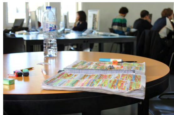
Figure 4 - Sharing knowledge and debating ideas

One of the ideas of the “Mostra-Te” project is to bring researchers and creatives close to the students by motivating an informal conversation, so that students feel comfortable to put questions, interact and learn with the experience of others.