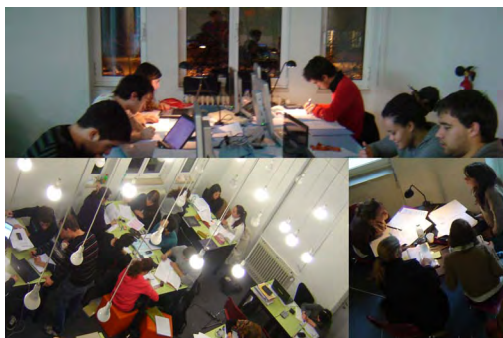
Figure 5: different aspects of the occupation

Ideia.m is a new company created as a result of an academic project in research and development of musical instruments. Ideia.m is specialized in advanced materials and technologies, mainly related with composite materials. The company works on this musical project and expanded the activity to other areas, such as automotive, laboratorial and furniture components design and production. At the e-learning café Ideia.m performed a very interactive presentation, explaining how the idea of creating the company started as a result of a final project in one of the courses in the last year of the university. An example of the guitar developed by the company was exhibited at the e-learning café before and after the presentation. During the presentation some of the participants were able to play and manipulate de guitar.