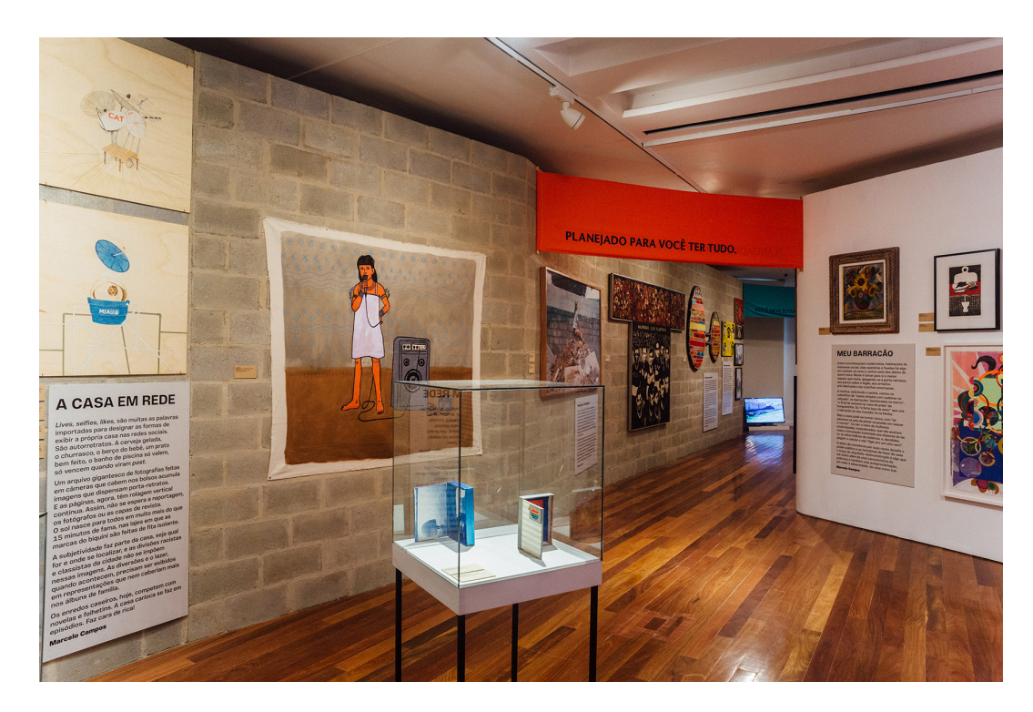
FIGURE 8 Nuclei The House on the Network and My Shanty. [Colour figure can be viewed at wileyonlinelibrary.com]

A sensitive and critical look at the issues and realities addressed articulated the expository narrative, which manifested itself both in the textual content (Figure 8) that contextualized each nucleus, as in the expography. As essential elements for the construction of another discourse, they distanced themselves from the romanticization or exoticization of that which is the result of a historical issue, of a political articulation of territorial division (Campos, 2021). Precariousness is a reality, the lack of technical assistance in the construction of dwellings results in vulnerable houses that put their residents at risk. Without disqualifying these constructions, the curators reconstructed a narrative of social housing that sought to give new meaning to the way people see their conditions—objective and subjective, according to Campos (2021),