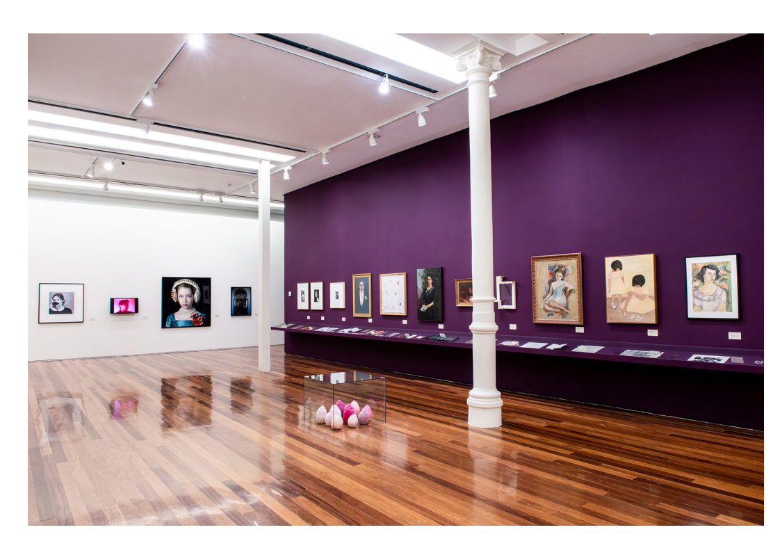
FIGURE 2 View of the nuclei Portrait Representation. [Colour figure can be viewed at wileyonlinelibrary.com]