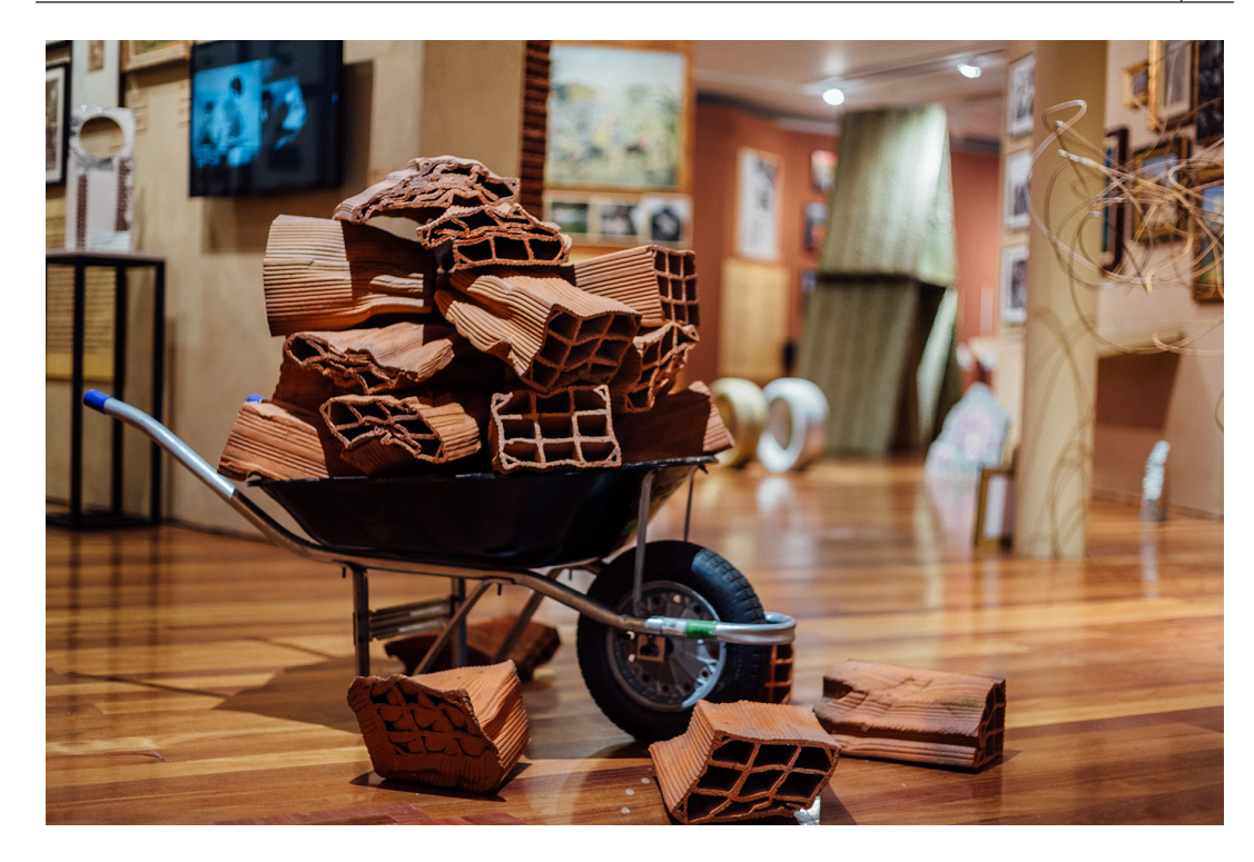
FIGURE 9 Andrey Zignnatto, Stacking, 2014–2016. Crumpled bricks on a wheelbarrow. [Colour figure can be viewed at wileyonlinelibrary.com]

attributing value to self-constructed houses, belonging and pride to those who built their dwelling with their own hands (Figure 9).