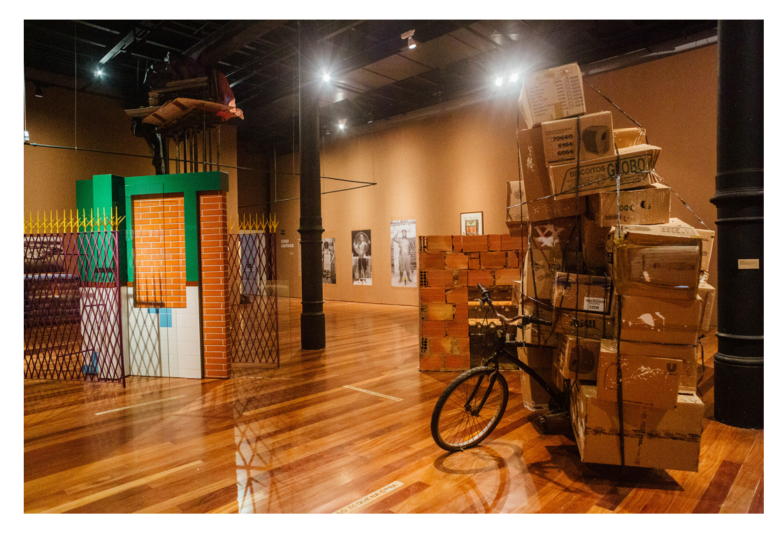
FIGURE 6 View of the Casa Carioca exhibition. [Colour figure can be viewed at wileyonlinelibrary.com]

Houses made of wood, zinc tiles, clay, exposed bricks that will never be plastered. Houses built for years on end, by builder masters and the neighbourhood itself, which always pull together for building, always in joint effort [...]. Enlarged houses