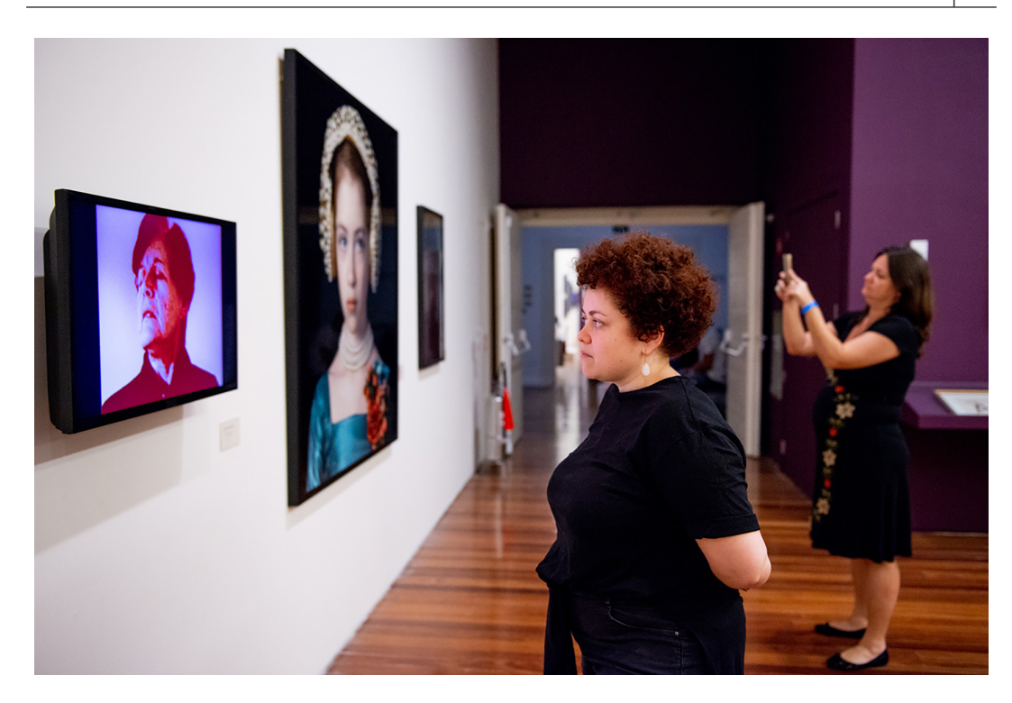
FIGURE 3 View of the nuclei Portrait Representation. [Colour figure can be viewed at wileyonlinelibrary.com]