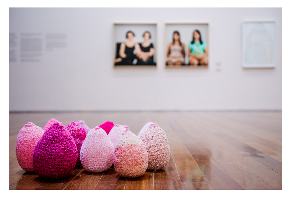
FIGURE 4 Detail of Ana Miguel's work. [Colour figure can be viewed at wileyonlinelibrary.com]