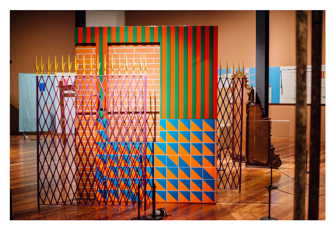
FIGURE 7 Rommulo Conceição, The fragility of human affairs can be an indisputable spatial limit, 2015. Glass, metal, ceramics, and automotive paint. [Colour figure can be viewed at wileyonlinelibrary.com]

In this sense, artworks by young and peripheral artists have been summoned, from distinct contexts considering socio-racial, ethnic, and gender representativeness, who discuss the issues addressed by the exhibition through their own life stories, among which Tadáskía (max wíllà morais) (1993), Agrade Camiz (1988), and Rafael BQueer (1992). Their works were exhibited side by side, without hierarchical or chronological divisions, with works by historically consecrated artists and from different generations. According to Fernandes (2020), these