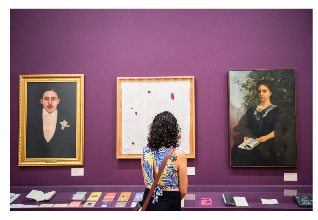
FIGURE 1 View of the nuclei Portrait Representation. Photograph by Daniela Paoliello 2018. [Colour figure can be viewed at wileyonlinelibrary.com]