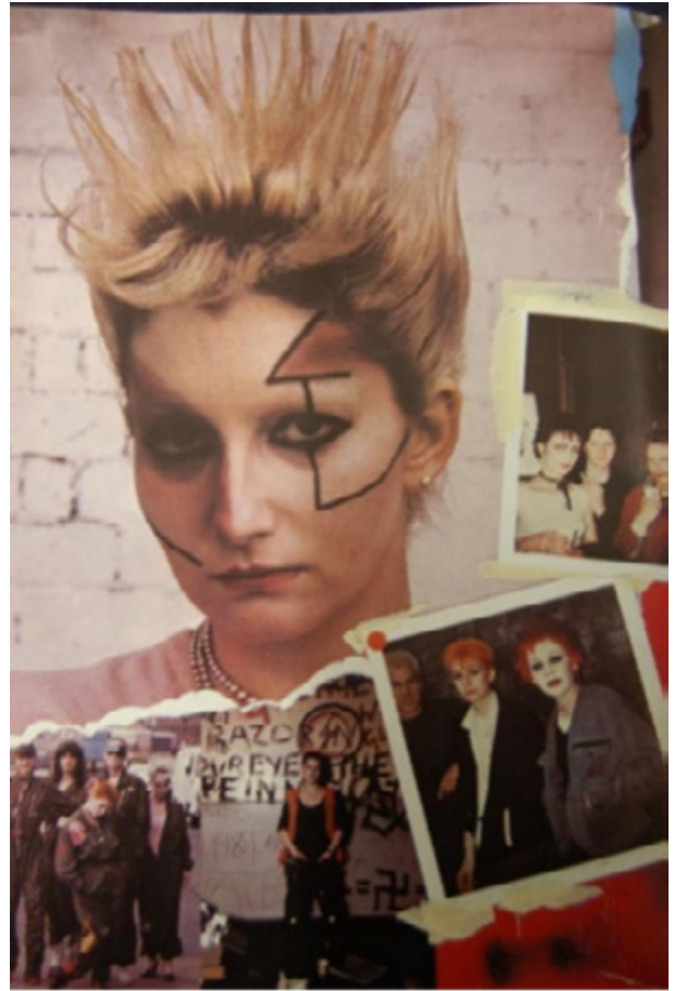
► Figures 7 – Left: Jordan in British Vogue, December 1977. Right: New Musical Express magazine, 1977 ► Source: https://www.kerrytaylorauctions.com/story/remembering-jordan-the-high-priestess-of-punk/