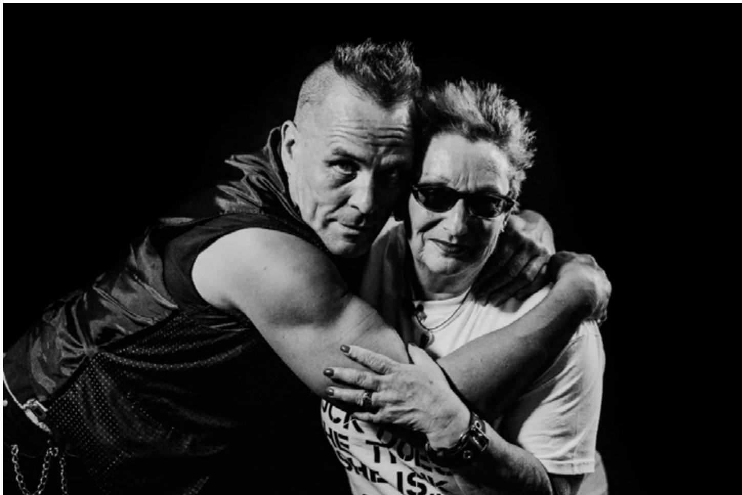
► Figure 10 – Jordan with John Robb at KISMIF Conference 2018 in Porto

It stayed that way for the rest of his life. Whenever punk was mentioned, Jordan was mentioned. With the return of nostalgia, as Reynolds tells us, there was more and more interest in his life, which resulted in the biography 'Defying Gravity: Jordan's Story', published in 2019. And it was with great pride that Jordan was present, as key-speaker, at the 4th edition of KISMIF 2018, "What difference do DIY cultures make?", in which she even addressed the issue of ageing as a punk and especially as a punk woman who does not bow down to social conventions. Very soon there will be a mini-series about the Sex Pistols called Sex. One of the main characters will be Jordan, of course. She will be played by Maisie Williams, a British actress who became world-famous playing Arya Stark in the TV series Game of Thrones.