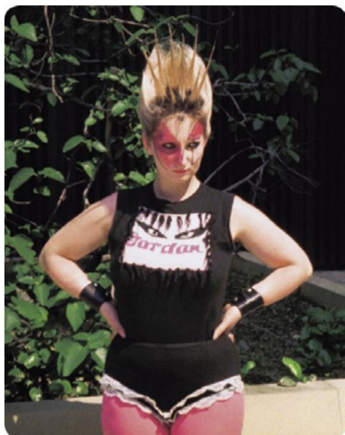
► Figure 5 – Jordan c.1977 wearing her self-customised Westwood/McLaren t-shirt, 'Let It Rock' labelled, 1974-75

Jordan herself tells in her biography 'Defying Gravity: Jordan's Story' (Mooney & Unsworth, 2019) that travelling to work was an adventure. Because she took public transport and didn't shy away from dressing in SEX's style, she provoked equal doses of loathing and attraction. Either people would 'run away' from her or – mainly men - go to her side and pretend to read the paper. She admitted that 'men were confused by her. They would whistle, shout anything and everything, even offer me money, this was because they didn't understand why I was dressed like that' (Jordan in Tierney, 2019).