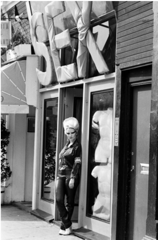
► Figure 2 – Jordan at Vivienne Westwood's 'Sex' shop on the Kings Road in 1976