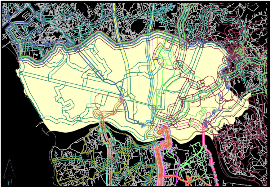
Figure 1: An initial view of the information carried by the operators on the central area of (AMPorto) (Seabra [15]).

Regarding the desired integration of the transport networks and the integrated solutions in the territorial intervention, you could add more value to the construction of the current database if, beyond the required data rightly divided by the responsible entities as shown in the previous Table, you could incorporate other equally pertinent data like the size of the population, housing, family income, dominant age groups, motorization rates, modal distribution, the daily mobility of the population, the main equipment that generate demand (schools, health units, commercial areas, service areas, financial areas, etc), parking lots, great transport interfaces, terrain inclines, significant elements to security questions, proximity to road axis of great capacity, interface operation: Schedule articulation. These levels of analysis show up as an intention by the Portuguese government after the information carrying phase regarding the collective transport networks is completed, as can be seen in the results shown in Figure 1.