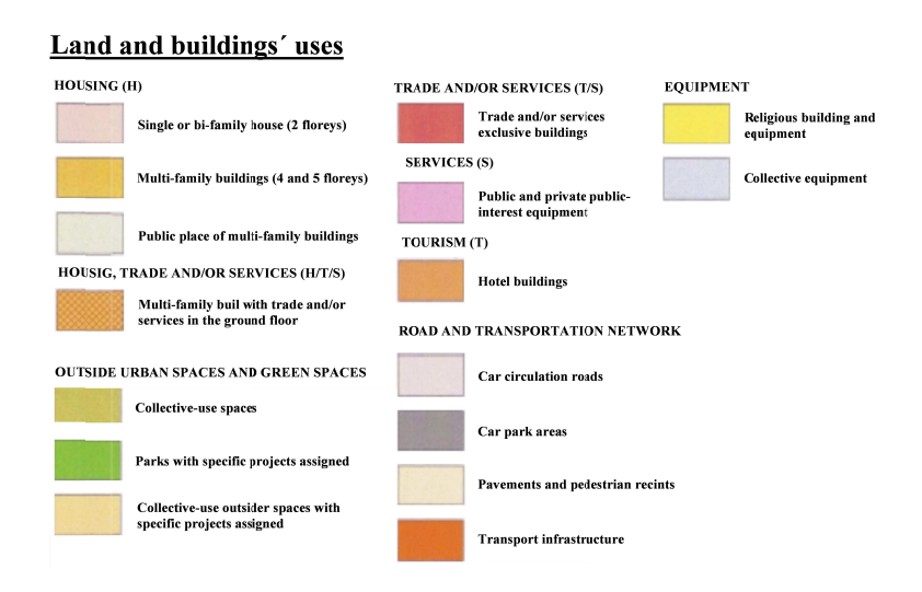
Figure 2. Implantation Plan settled in the Detail Plan of Avenida Papa João XXIII