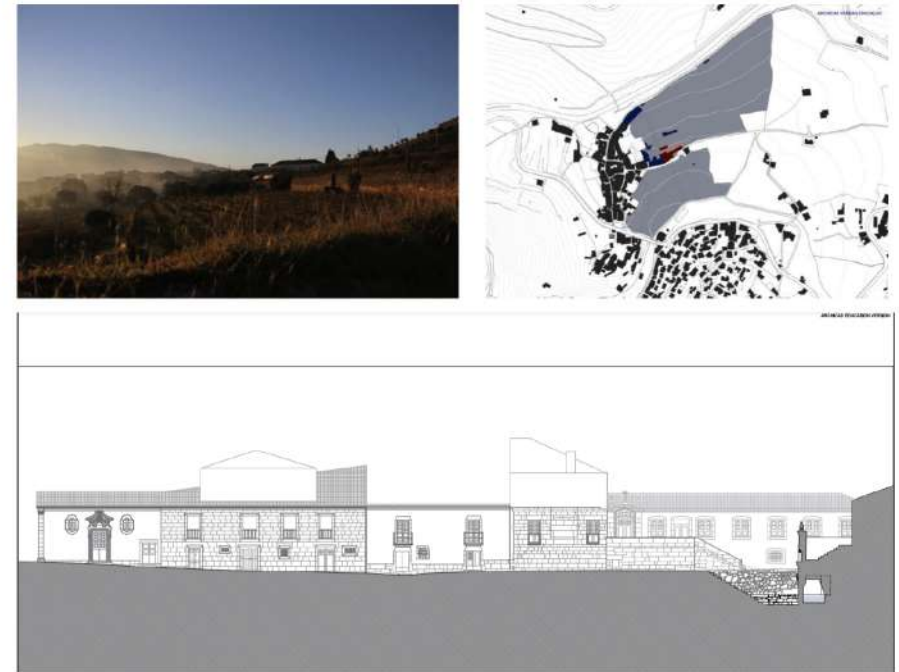
Fig. 1 Valdigem, Lamego. Fig. 2. Valdigem, Lamego. Drawing by students. FAUP. Fig. 3. Casa da Fonte. Casa das Brolhas e Fonte de Mergulho, Rua das Brolhas, Valdigem, Lamego. Drawings by students História da Arquitectura Portuguesa, 2018/2019, FAUP.

theoretical and practical framework. Why does Valdigem need a plan? Because landscape management cannot be done without identifying principles, problems, players, methodology, budget, and monitoring, which will imply a small unit working directly in the community. This postponed, Valdigem might lose its main buildings soon, not being even aware of the dimension of this loss.