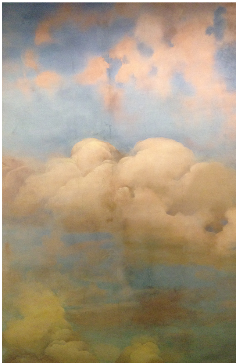
01 entre mãos...[Teatro Olímpico, Vicenza, Andrea Palladio e Vincenzo Scamozzi]