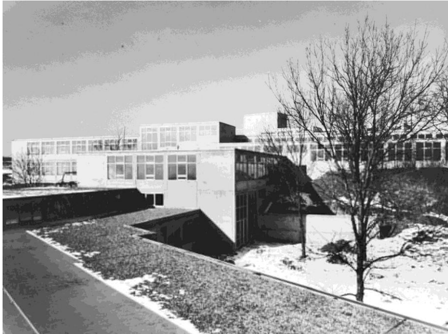
Figure 1. Hochschule für Gestaltung (HfG) Ulm / Ulm School of Design (1953-1968). Architect: Max Bill. Date 1955.