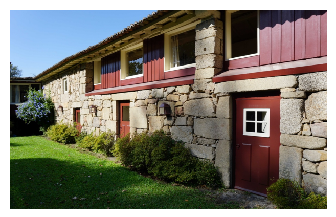
Figure 4. Façade facing the backyard.