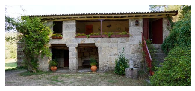
Figure 3. View of the west façade.

As Távora points out, "the development of the project was unorthodox, in the sense that, once the first sketches had been made, the execution was undertaken without the need for plans" (Távora, 1993). Most of the architect's work took place at the construction site, giving the appropriate instructions to workers in a similar way as a master builder would have done centuries ago. In the absence of plans, visits to the site were constant and all unforeseen events were resolved spontaneously, with drawings being made on the wall or on any surface within reach. In fact, the documents that had to be submitted compulsorily to the town hall resulted from a subsequent survey, which was unofficially compiled at the architect's studio. This apparent improvisation was based on trust and the good understanding between Távora and the labourers, who, like him, mastered the traditional construction techniques.