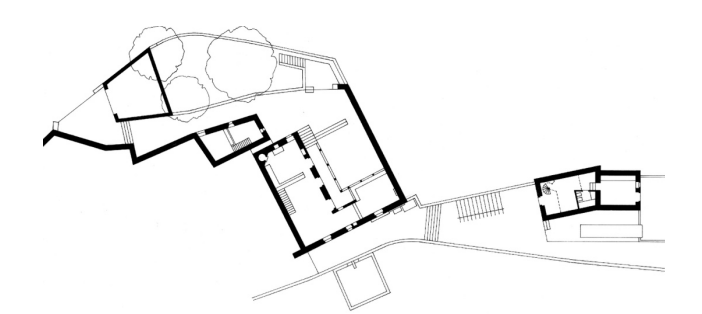
Figure 6. First floor plan. (FIMS/FT/0282-pd0001).