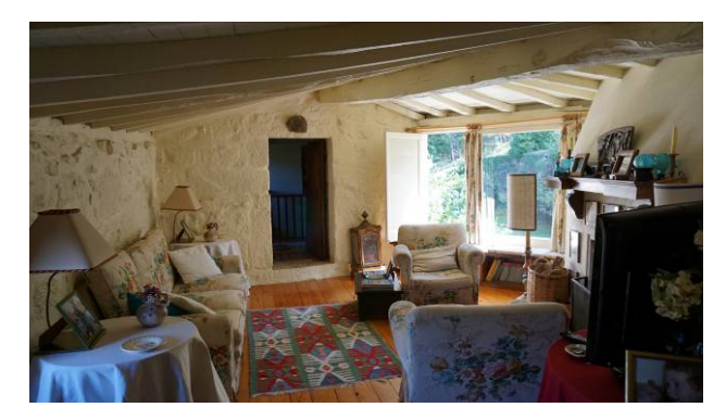
Figure 5. Sitting room.