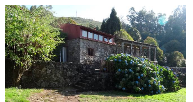
Figure 8. Casa da Eira.