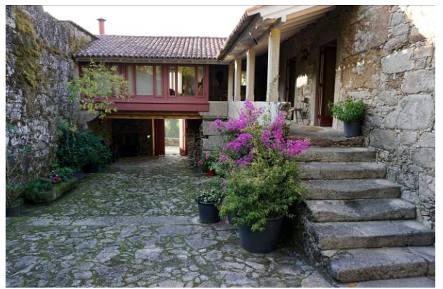
Figure 7. Veranda and glazed porch facing the courtyard.