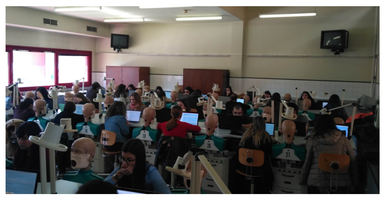
Figure 2. Students taking a BYOD exam at Faculty of Dental Medicine