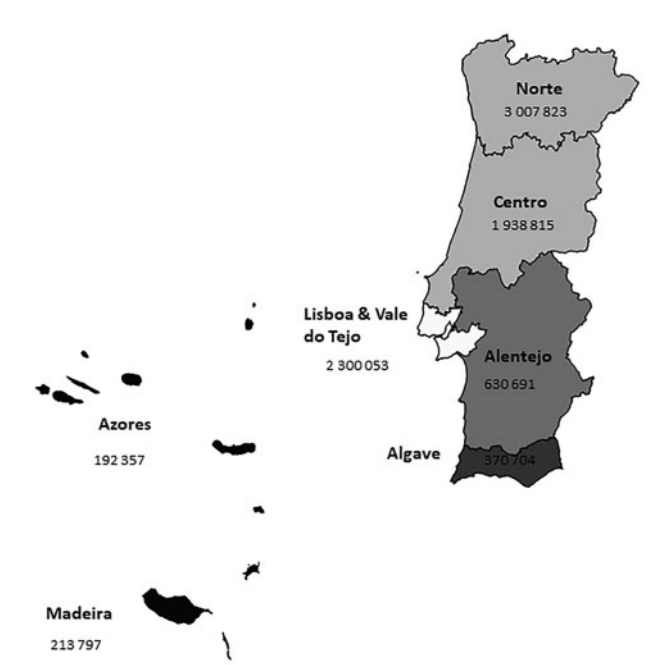
Figure 1. Portuguese population density distribution according to the 7 NUTS II.

Considering the primary aim of EpiDoC 1, the sample size was calculated based on the estimated prevalence of rheumatic diseases with a 95% confidence interval (CI), and