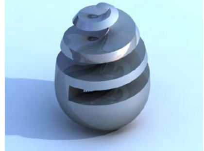
Fig. 2. Funnels based on the grape shape (design by Filipe Amaral).

The prototypes were then tested in decanters to verify functional and aesthetic requirements (fig. 3). This step allows the detection of conception mistakes and corrects them to achieve more functional and optimized designs in a short period of time. The final prototypes were then obtained and polished and painted with a metallic colour.