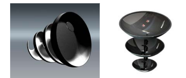
Fig. 1. Funnels with helical surfaces (design by Isabel Machado).

Wine decanting funnels with incorporated filters, and unique original designs with channels that conducted the wine down to the inner walls of the glass decanter vessel, to quickly intensify the aromas that normally are developed with years into bottle (fig. 1), were conceived. The funnel grape shape of fig. 2 is an unusual approach that fulfils the same objective but has a simultaneous very attractive decorative function [5].