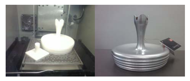
Fig. 9. SLA prototypes.

Concluded the development creative phase, a multimedia presentation was done to the company. All the developed proposals were presented in a digital format, with simulations of the objects in house environments. Together with the presentation, the SLA finished prototypes were presented (fig. 9), which made a strong impact on the company head, which immediately got motivated to produce the parts. At the same time allowed a very interesting discussion involving manufacturing possibilities and limitations and it was immediately obvious that many adjustments had to be done, essentially because of the "lack of feeling" about the tin mechanical resistance, drafts on the moulds, joining limitations (this aspect opened another possibility of collaboration to develop joining procedures using adhesives), etc.