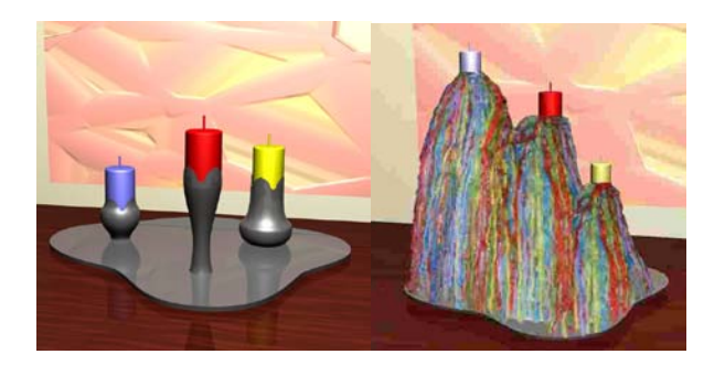
Fig. 8. Candelabra. The melted wax is accumulated on the base (made in pewter or in composite), producing coloured wax sculptures (design Vasco Sepúlveda).

Other part seeks the promotion of light effects and textures obtained with the contrast among tin, glass or aluminium, and others have the particularity to join an innovative material in its conception, the epoxy resin mixed with others, creating an innovative profusion of colours. Fig. 8 shows a thematic explored in this work which is sculptures that can be obtained with colour melted wax that can be created for decorative purposes in tables of restaurants and others.