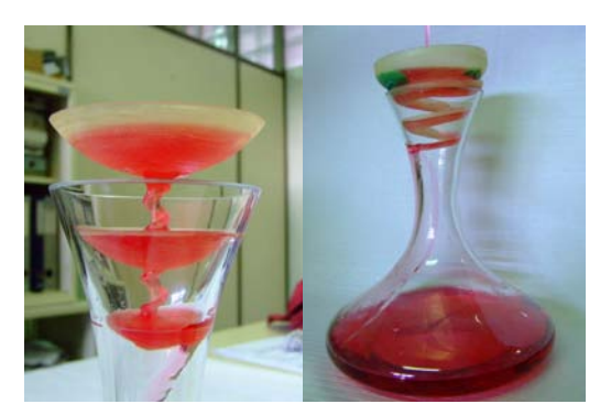
Fig. 3. Functional tests with SLA prototypes.

expressed great interest to produce and commercialize the five proposals. Using the prototypes, the pewter company produced the respective moulds to get the final pewter prototypes to be sent to client (Fig. 4). Three of the five products were immediately approved and a 325 placement order was accorded with the customer.