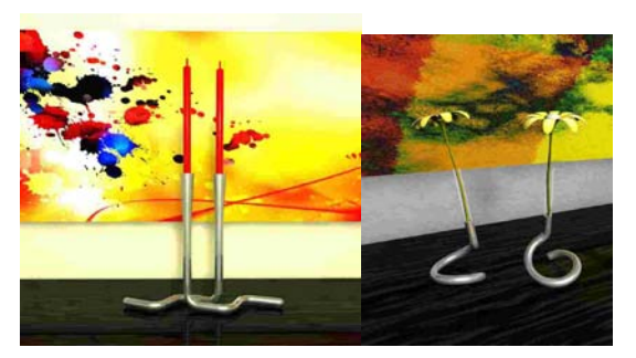
Fig. 6. Candelabra with curved tubes (design by Helder Faria).

A first choice was for the parts that could have more market or presented features that were more established on the company. These impositions derived from the short period of time that the team