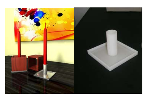
Fig. 7. Candelabra with noble wood (panga-panga and others) parts (design by Helder Faria) and SLA prototype.

The objects were inspired in floral motifs with organic shapes where sometimes it was seek the colours profusion existing in a garden, on the waves produced by a drop in the water and marine motifs. The LoveStory part is inspired in a poetic side of love, in the relation between couples (Fig. 6). The candelabra Cube (Fig. 7) is a mixture of two arts, the pewter and wood.