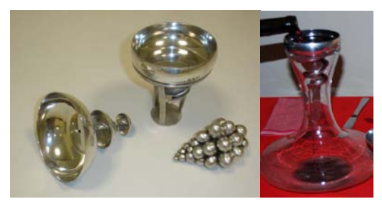
Fig. 4. Final products in pewter.