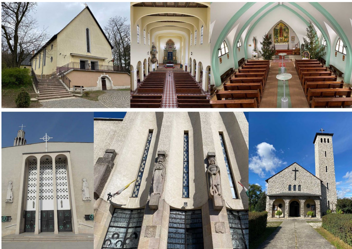
Figure 1 Examples of the style-pluralism in the interwar period in Hungary