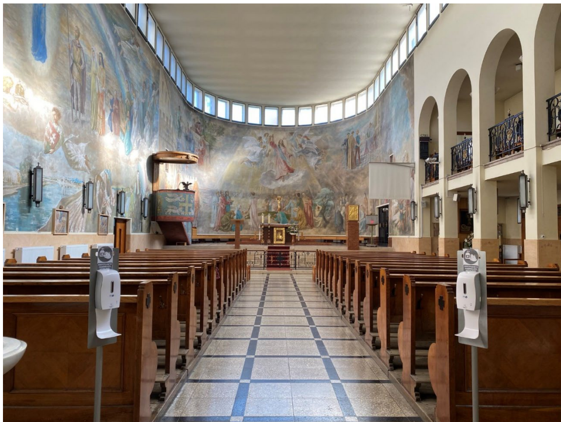
Figure 4 Parish church in Győr-Nádorváros, designed by Nándor Körmendy

ishment of a complex typology. This typology and its subsequent evaluation have revealed evidence of the Church's commitment to its historical traditions, signs of which are inevitably apparent even in the most progressive modernist churches. Classic proportions, as well as symmetry, associated unequivocally with beauty since the antiquity, are palpable in the design and structure of these church buildings.