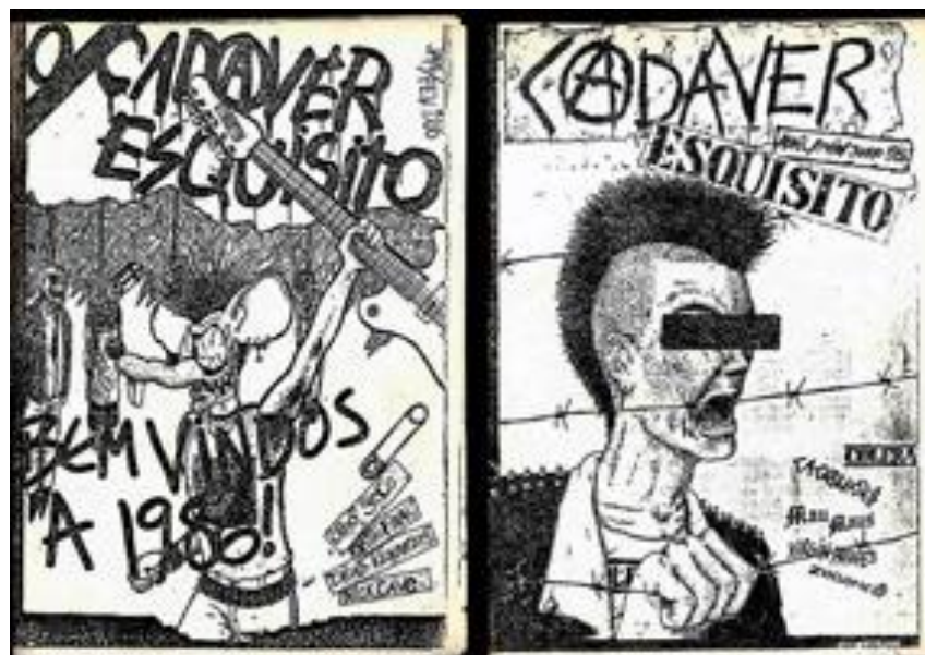
Figure 1 – Front and back cover of the fanzine Cadáver Esquisito (April / May / June 1986)

Following the development of punk scenes in Portugal, we witness during the 1980s a certain proliferation of fanzines although at this stage still largely concentrated in the metropolitan areas of Lisbon and Porto. In this period we can identify relevant punk fanzines such as Subversão (1982), Subúrbios (1985), Tosse Convulsa (1985), O Cadáver Esquisito (1986), Lixo Anarquista (1986-87), Suicídio Colectivo (1987), Anarkozine (1987), Post Scriptum (1987-88), Morte à Censura (1988), Culto Urbano (1988-89), among others.