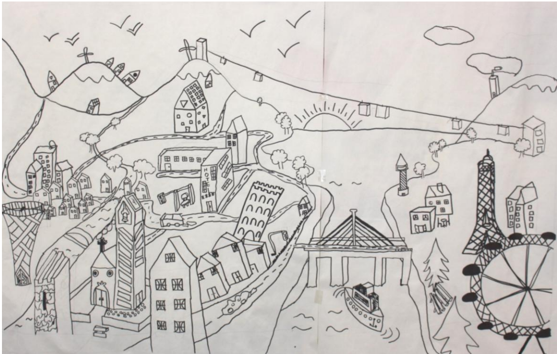
Figure 3 - Final collaborative drawing example. Workshop "Uma Cidade Para os Teus Olhos" archive data.

A more detailed analysis of the category of various facilities, that was around 20% of all items, revealed to be very interesting. This group splits into 12 different kinds of equipment that included the following categories, ordered by higher presence: 105 Exceptional buildings, 66 Trade, 42 Sports, 35 Religion, 32 Culture, 30 Education, 30 Health, 30 Industry, 15 City administration, 15 Security and 14 Tourism. A chart representing these categories per quantity is Figure 3. The number of exceptional buildings in the children's cities exceeds all other types of urban facilities. Surprisingly, the most numerous facilities (exceptional buildings) have no survival value like all others, but a communitarian symbolic value.