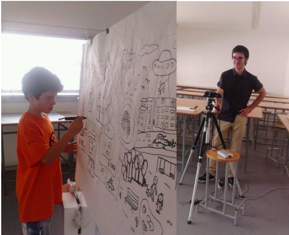
Figure 2 - The filming room. Workshop "Uma Cidade Para os Teus Olhos" archive data.

The final collective drawings become the raw data for an analysis conducted inside a research that generically questions: What do children value the most in a city? The visual analysis of the fifty-nine drawings produced at these workshops allowed us to recognize and quantify the different urban facilities that the seven hundred and eighty-six children elected to feature on these idealized cities, and to categorize them.