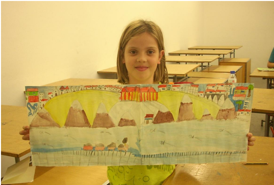
Figure 1 - First drafts example. Workshop "Uma Cidade Para os Teus Olhos" archive data.