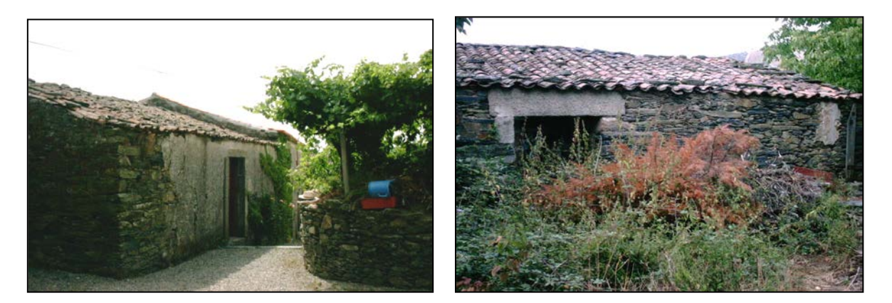
Fig. 4 - The situation before the project.