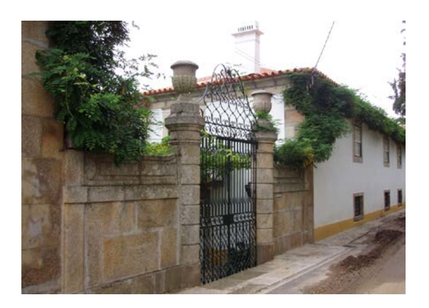
Fig. 2 - Casa da Azenha (Cambres, Lamego), a noble manor house dating back to the 17<sup>th</sup> century, surrounded by the estate's vineyards.

Traditionally, the persons responsible for the estate, who descend directly from the Count of Alvelos, based their activities until the early 2000s on the production and marketing of wines. However, after UNESCO classified the region, they embarked on the renovation of the