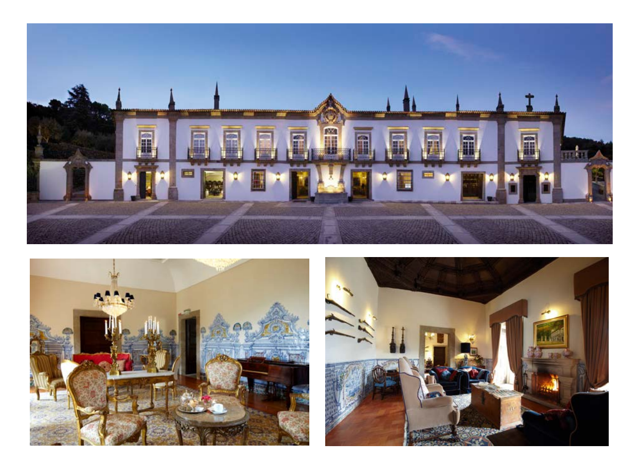
Fig.7- The manor of Rede (Santa Cristina, Mesão Frio) whose origins date back to the 15<sup>th</sup> century, and where tiles from the 18<sup>th</sup> century have been preserved.

The vast façade of the building with its large rooms overlooks the river, and boasts magnificent well-preserved glazed-tile walls dating from the 18<sup>th</sup> century (fig. 7). The manor house includes a Baroque chapel dedicated to Saint John the Baptist, and has not been changed since the 19<sup>th</sup> century, when it was restored by José Maria Cerqueira Borges Rebelo, a nobleman from the Royal House (Silva, s/d, 96), and was already surrounded by extensive forest, orchards, vineyards and kitchen gardens.