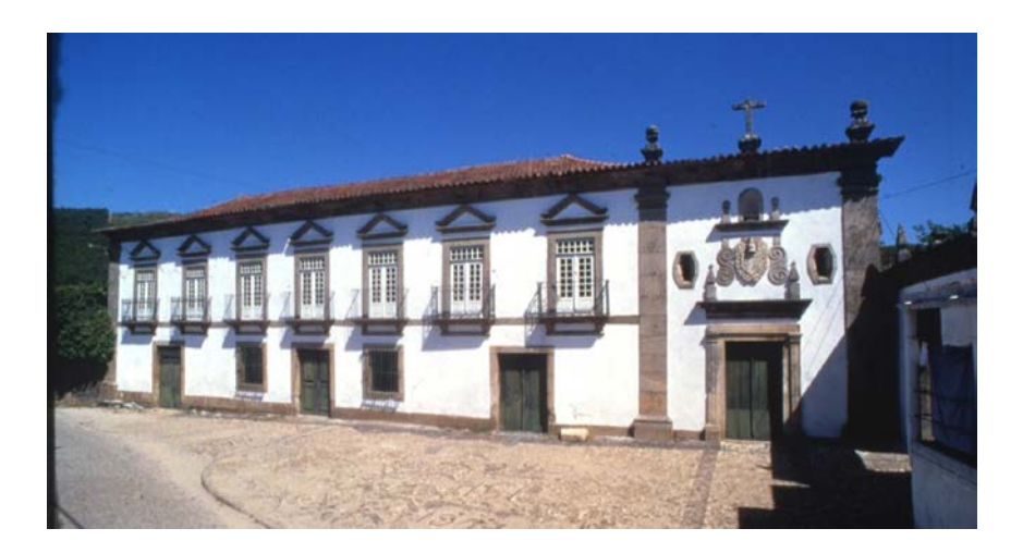
Fig. 3 - Casa da Calçada (Provesende, Sabrosa), a manor of erudite architecture, dating from the end of the 17<sup>th</sup> century, classified as a "Building of Municipal Interest" and of "Public Interest".