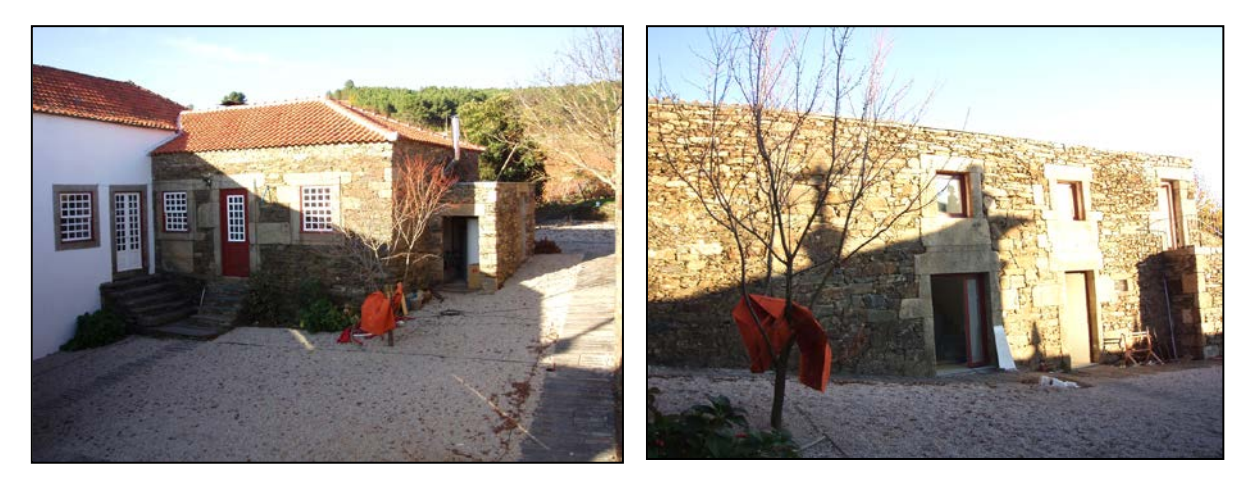
Fig. 5 - The current situation after reconversion of the farm outhouses.

Lastly, despite the fact that the TER is quite recent in Casa da Calçada, this estate has been open to the public since the 1990s, welcoming hundreds of visitors, offering lunch/dinner and business meetings, and is also the stronghold of the Provesende village, being decisive for the classification of this centre as a "Historical Wine Village". The estate has also hosted other activities, such as the photography workshop organized by the team of the Norwegian photographer Morten Krovgold, in 1998<sup>49</sup>, and in the same year it organized a cycle of seventeen meetings called "Encontros da Casa da Calçada" for the discussion of some regional problems, which gave rise to strategic proposals<sup>50</sup>; to enhance the documentary Archive of the Casa, in 2000, the owners signed an agreement with the District Archive of Vila Real, thus preserving the heritage of Provesende and the role of this family in the development of the region; in 2002, the estate hosted an exhibition on the fight against phylloxera, showcased in the warehouses of